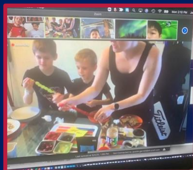
Star Wars Cooking Challenge on STEAM Day

As Covid-19 has drawn on, we have found ourselves repeatedly looking at cancelled events in our calendar, where it was normally full of activities of all types. During campus closure, we also found that students were tiring a little of the e-Learning routine and hence decided to freshen things up a little with virtual 'Theme Days' that would have been celebrated had we been on campus. 'May the Fourth be with You' became an online STEAM event, and we celebrated Global Community Day and Climate Action Day with fun and creative student-led activities and workshops, topped off with a keynote speaker via Zomo. With a solution-focused approach, the school found that music competitions and sports challenges could not only continue but also be exceptionally fruitful.