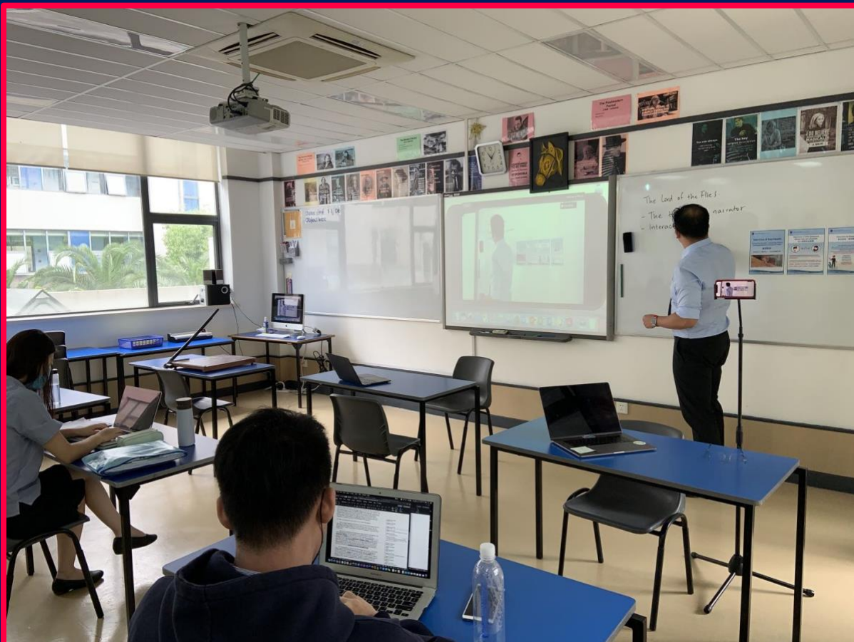
Blended approach, with some students keeping physical distance in class and those overseas connecting online