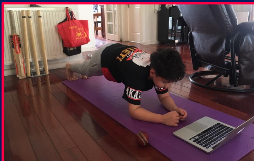
Scheduled Fitness Sessions – YCIS Pudong: Active Community!