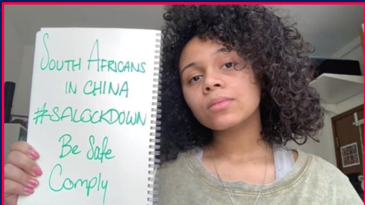
Service Learning doesn't stop during lockdown: student music video to raise awareness of the importance of adhering to lockdown procedures

Even getting back onto campus may not feel totally normal for some time, as students and/or teachers adapt to new routines. As staff, it is important to be mindful of and sensitive to the challenges all individuals may be facing in transition. Throughout all these scenarios, the school prioritises social-emotional support for our whole community.