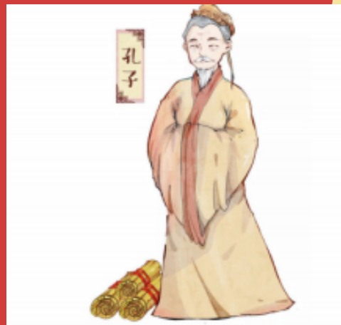
中华经典故事 Classic Stories