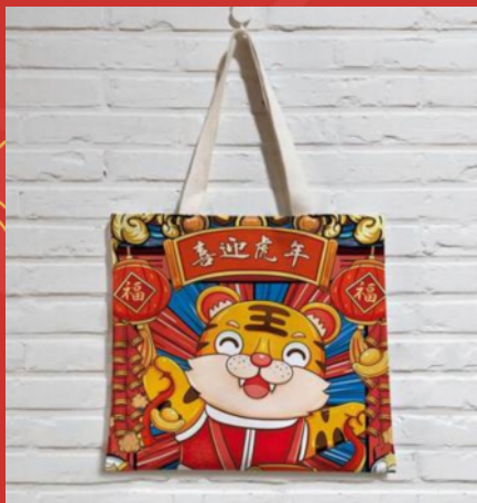
环保包设计比赛 canvas bag Design