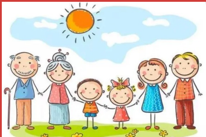
家训 (Haruka) AIR Project - Family Motto